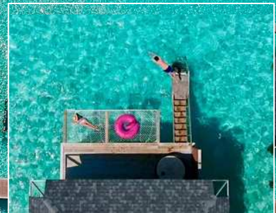
Over Water Villa (77sqm)