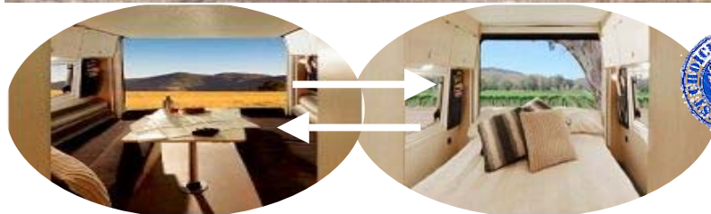
白天可作座椅及休息間 → 晚上易變床褥(以電動操作)