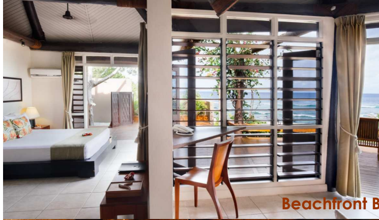
Beachfront Bure Suite

All Inclusive Package included Liquor Inclusive :$960/Adult Includes beverages from the standard wine, beer and drinks list. The premium list including French Champagne, fine wines & premium beverages would incur an additional charge to clients.