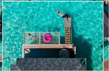
Over Water Villa (77sqm)